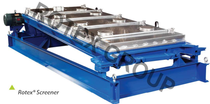
▲ Rotex® Screener