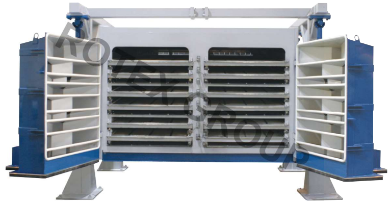
▲ Minerals Separator™ Full Size Model