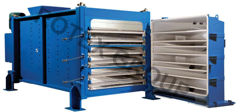
▲ Minerals Separator™ Half Size Model