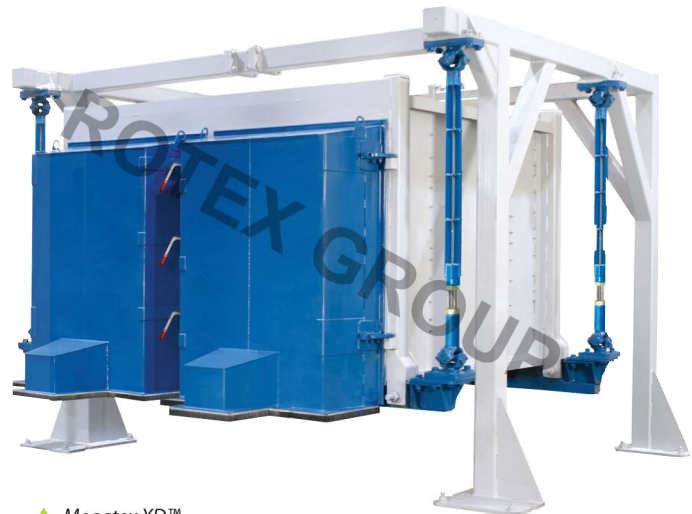
▲ Megatex XD™