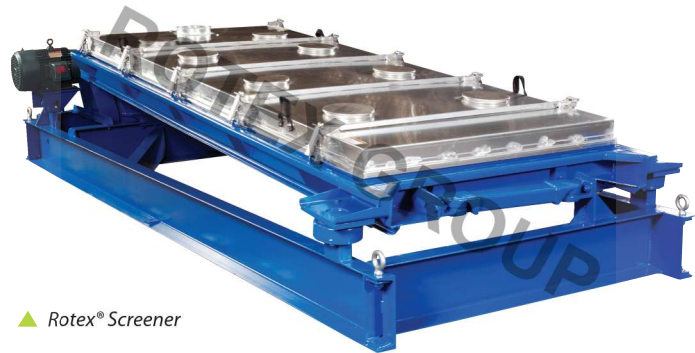
▲ Rotex® Screener