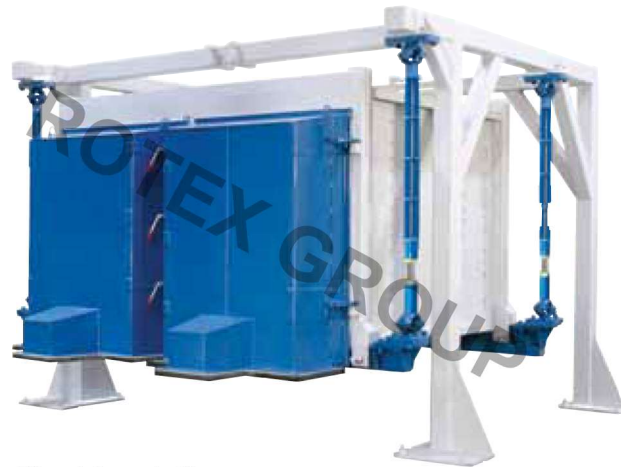
▲ Minerals Separator™