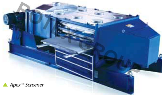
▲ Apex™ Screener