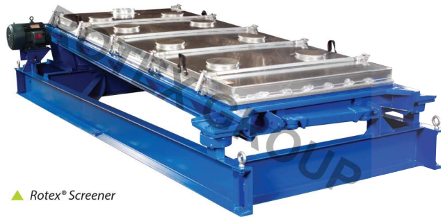
▲ Rotex® Screener