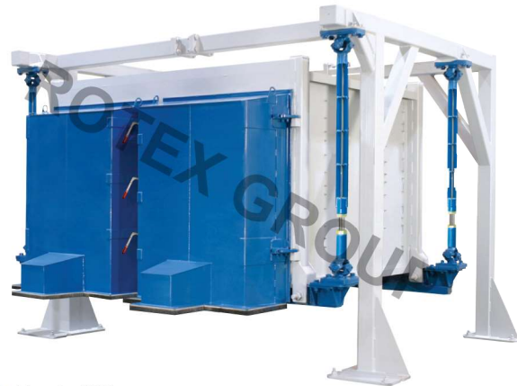
▲ Megatex XD™